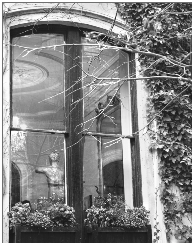
SMP's 2011 Annual Meeting was held at CMPS