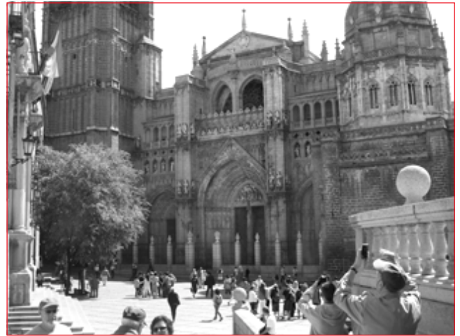
Spain's Toledo Cathedral, built from 1226 to 1493, is ranked among the greatest Gothic structures in Europe.

European soccer cup. How lucky we felt to be part of this exciting moment, surrounded by the throngs of celebrants in the streets following the game! We witnessed a huge gathering of young people peacefully demonstrating for weeks, sleeping in tents in the plazas of Madrid and Barcelona, demonstrating their angst about the forty two percent employment among the youth of Spain. We marveled at the infrastructure in these cities with their bullet trains, vast underground tunnels to drive through and immense underground parking lots. We also found delights just sitting in the plazas, sipping wine and eating tapas at little umbrella covered tables, relaxing and people watching.