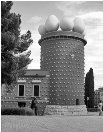
The Dali Museum, Figueres, Spain

In Madrid we visited the Reina Sophia museum and saw Picasso's Guernica and other extraordinary works of modern art and wonderful short films to view sitting down when our tired feet demanded a rest.