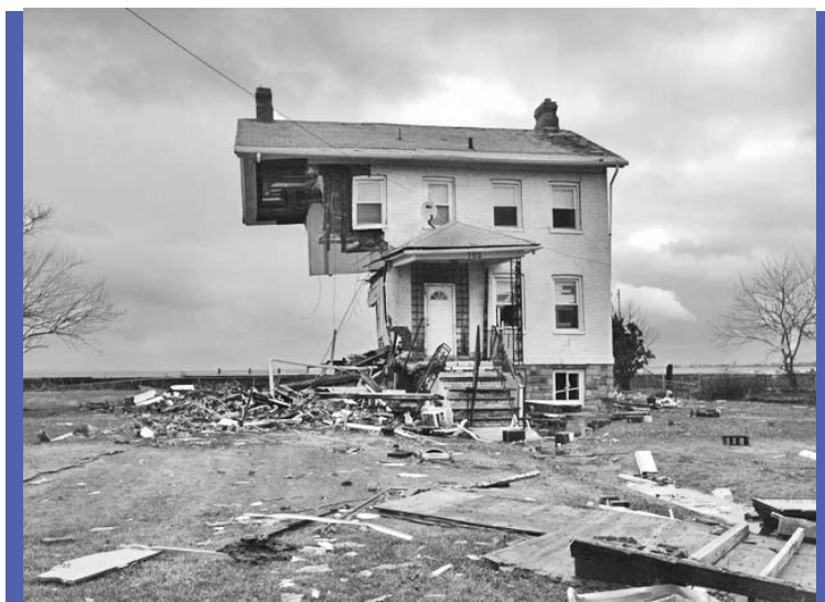
A home in Union Beach, New Jersey after Hurricane Sandy