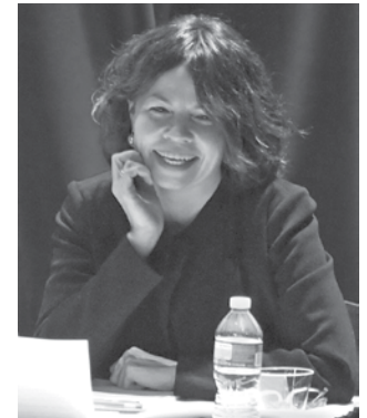
Morning panel member, Tracy Morgan, during the lively Question and Answer session.