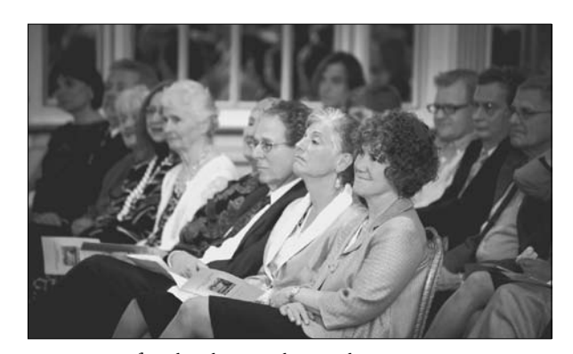
BGSP faculty during the graduation ceremony.

ON SATURDAY EVERYONE WAS INVITED to attend a full day of events, including two alumni panel discussions, lunch, an alumni association meeting, and a cocktail reception.